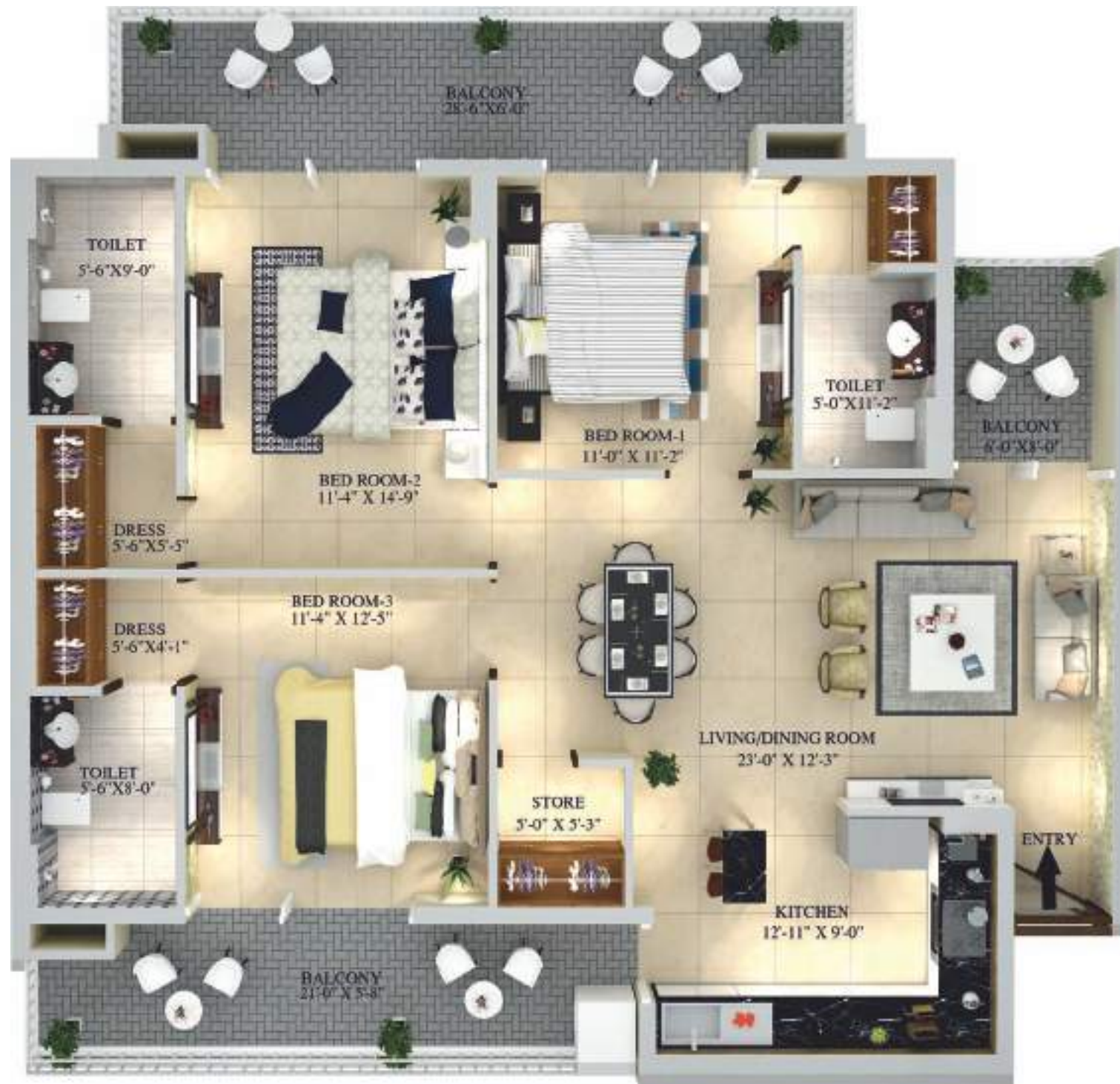
3 BHK - Tower : A, B, C, D, N, O, P, Q Carpet Area - 1110 Sq.ft. | Unit Area - 1549 Sq.ft. Super Area - 2100 Sq.ft.