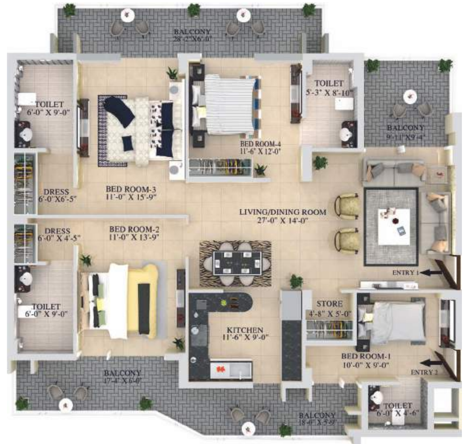
3 BHK + S - Tower : E, F, G Carpet Area - 1346 Sq.ft. | Unit Area - 1917 Sq.ft. Super Area - 2525 Sq.ft.