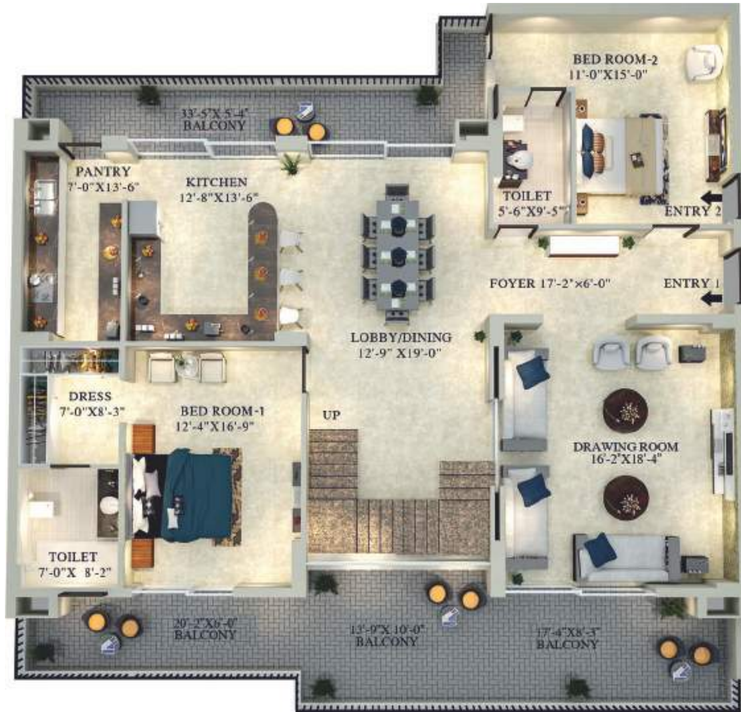
Duplex 5 BHK - Tower : J (Lower Floor) Carpet Area - 3323 Sq.ft. | Unit Area - 4559 Sq.ft. Super Area - 5750 Sq.ft.