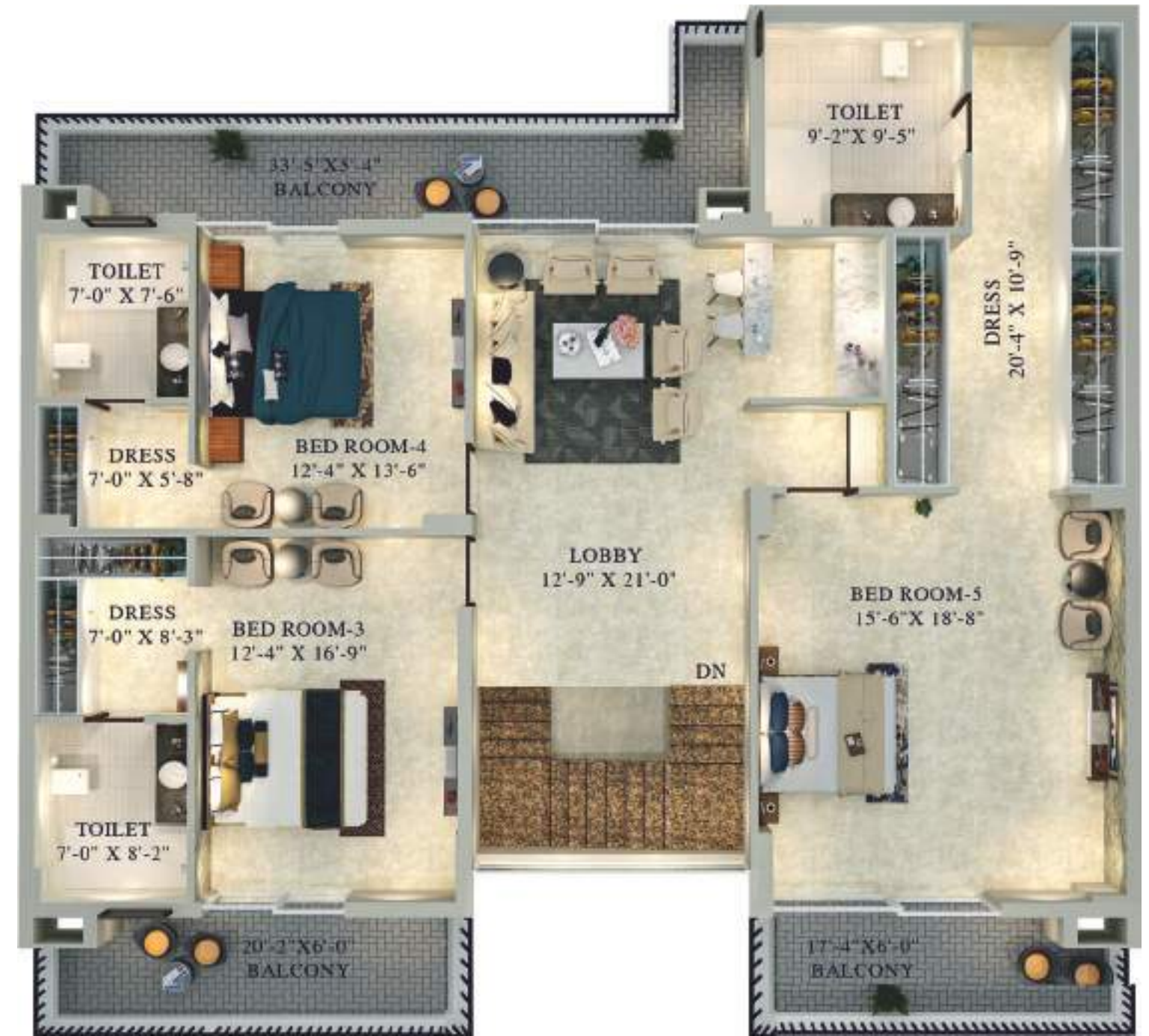
Duplex 5 BHK - Tower : J (Upper Floor)