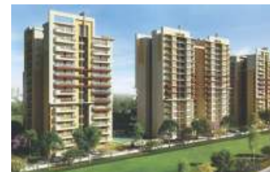
GREEN LOTUS AVENUE - CHANDIGARH AMBALA HIGHWAY -