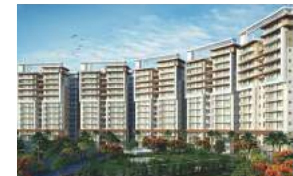
GREEN LOTUS SAKSHAM - ZIRAKPUR PATIALA HIGHWAY -